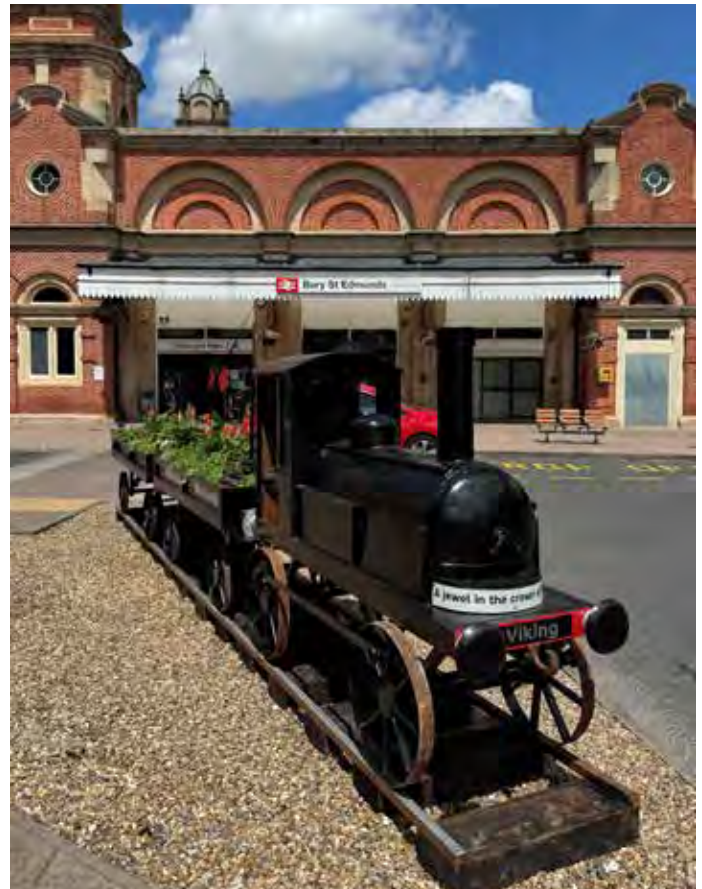
Locomotive installed June 2025