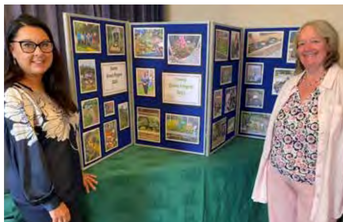
Two of our Greenfingers Judges July 2024

Plants this year were all supplied using surplus stock from our hanging basket production, and Greenfingers aims to interact and encourage as many groups as possible to create wonderful displays in their own gardens that are then judged throughout July. The theme this year is Trains.