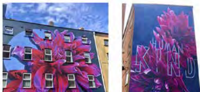
Example of past work from our preferred wall street artist

We are also currently looking to add a large-scale floral mural to the Market Thoroughfare, a direct pedestrian link connecting the Buttermarket (town centre) to the more modern arc shopping centre. Working in conjunction with Our Bury St Edmunds, the town's BID, Bury in Bloom is liaising with a professional street art consultant to enhance the attractiveness and visitor experience within the town centre – with the main focus being on plants!