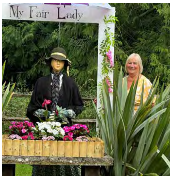
An entry into last year's competition theme 'Theatre'

In October every year, we host an Awards Ceremony to announce the winners and hand out certificates. The ceremony is sponsored by businesses too and representatives are invited to present the awards.