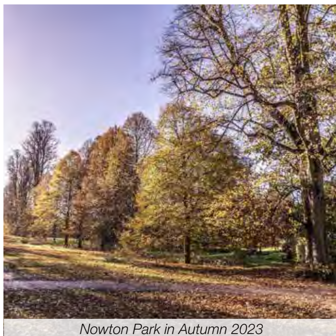
Nowton Park in Autumn 2023

Two designated wildflower areas can be seen within the Abbey Gardens, with one, the Wildflower Labyrinth, which is 36 metres in diameter and was designed to celebrate 1000 years since the founding of the Abbey of St Edmund in 2021. To this day, the site attracts endless numbers of pollinators and has become a popular tourist attraction.