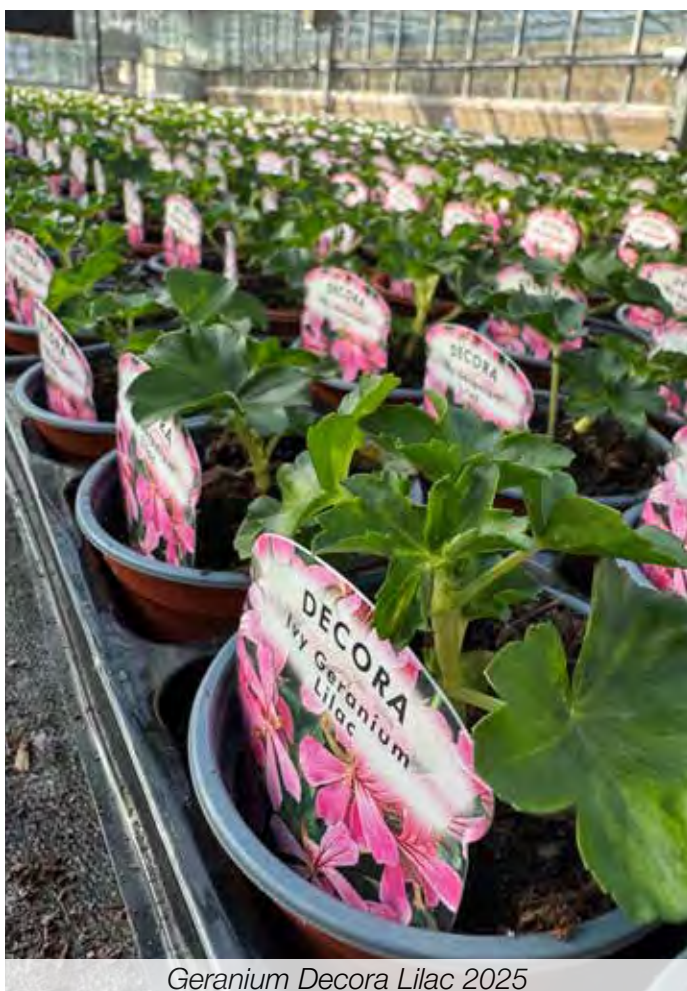
Geranium Decora Lilac 2025

suppliers of peat-free plants. Furthermore, even though we can't guarantee that young plants haven't been sprayed with chemicals by the supplier, here at Bury in Bloom we never use chemical controls to keep aphids at bay. If required, biological controls are used – which was exactly the case when growing our hanging baskets at Nowton Park Nursery.