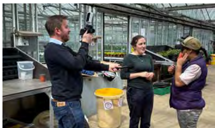
Filming for ITV Anglia May 2025'