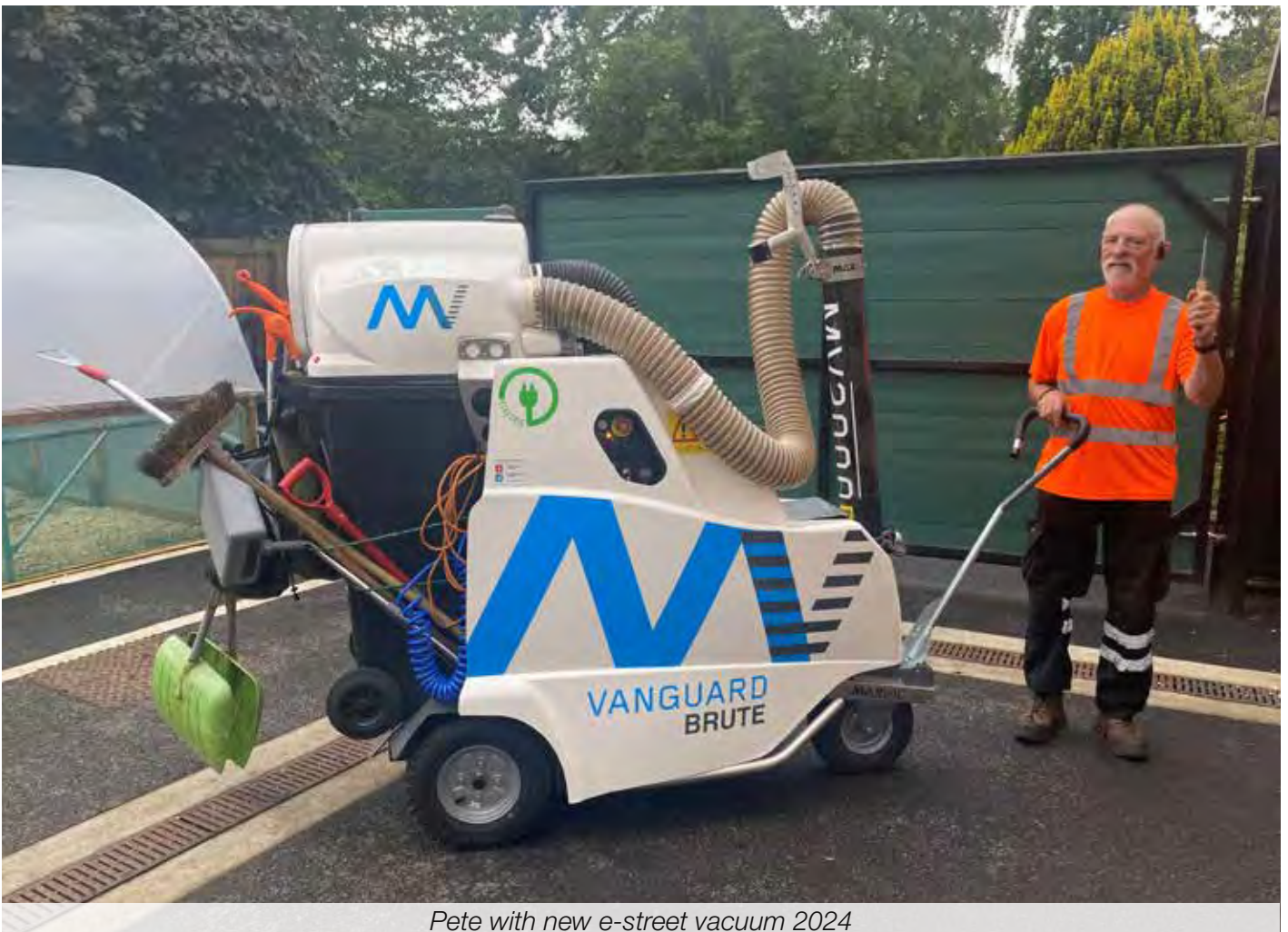
Pete with new e-street vacuum 2024