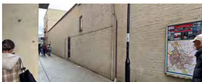
Market Thoroughfare wall to be transformed June 2025