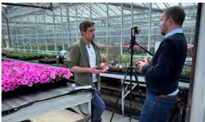
Filming for ITV Anglia May 2025'