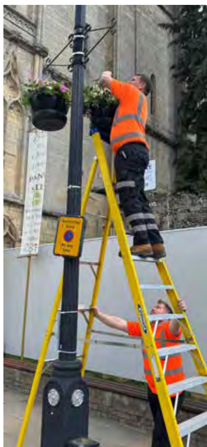
Basket installation Summer 2025