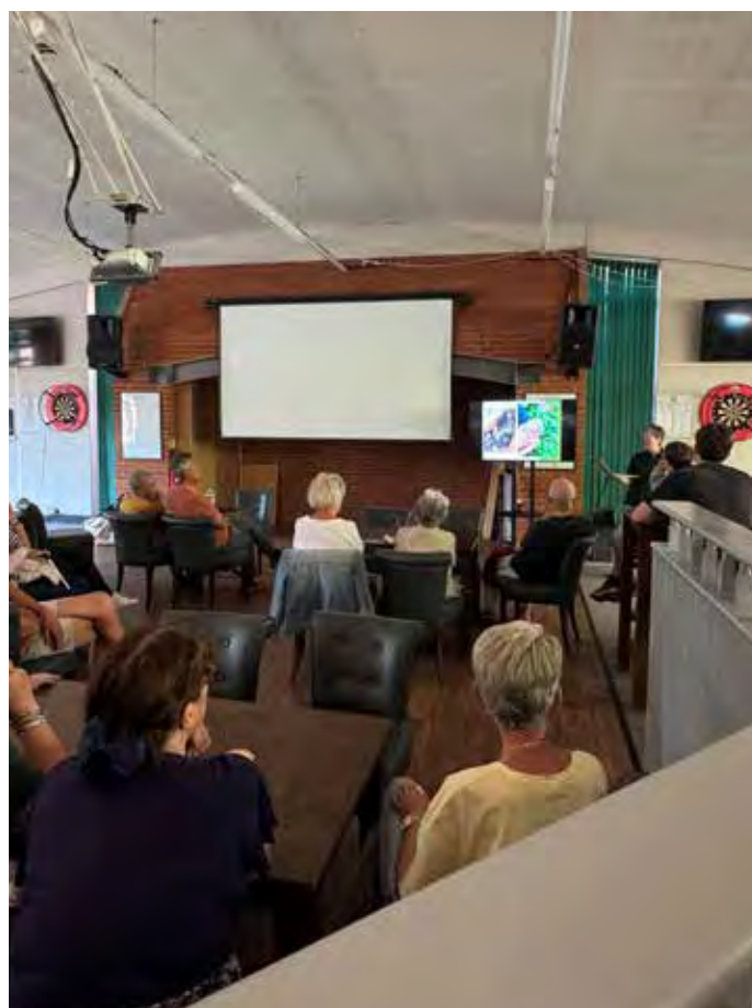
Hedgehog Talk in June 2025