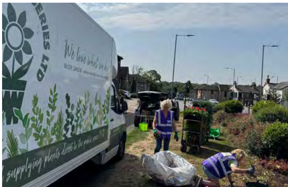
Smile being planted Spring 2025