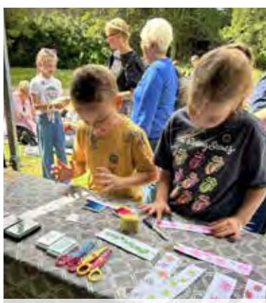
Craft materials at the workshop May 2025