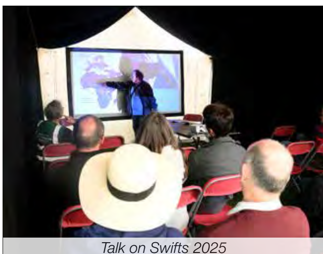
Talk on Swifts 2025