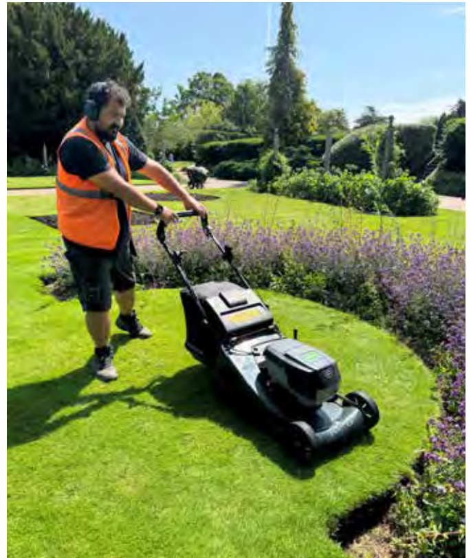
New battery powered mower June 2024

These new sustainable initiatives have been extremely well received and continue to be used for assisting our volunteer managed sites, as well as removing vegetation where required on footpaths and roadsides. The air quality is already improved with less petrol fumes in the atmosphere.