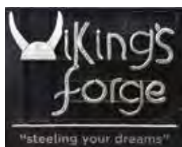
Floral Locomotive Supplier