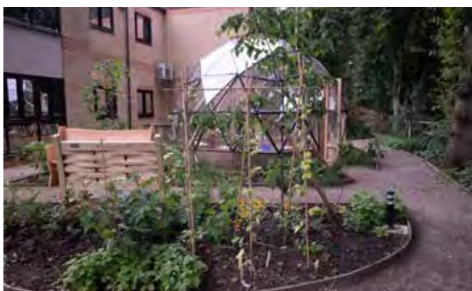
The Growing Garden 2024