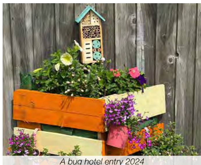
A bug hotel entry 2024