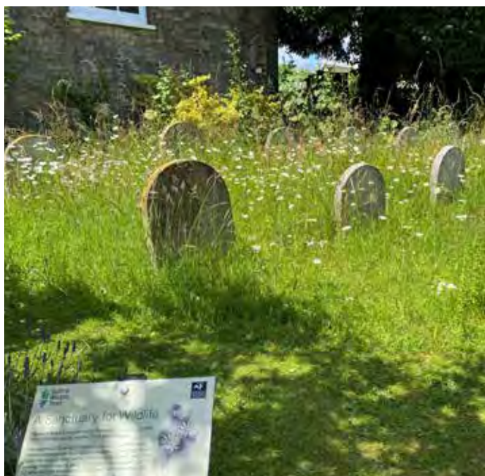
Signage explaining the environmental benefits 2024