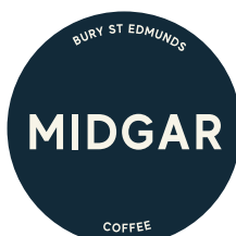
Pyramid Planter Sponsor