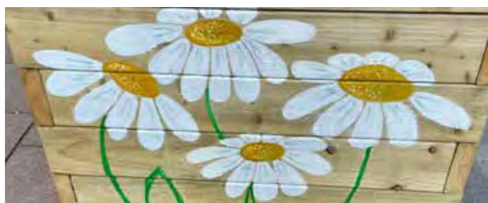
A herb planter Daisy mural 2025