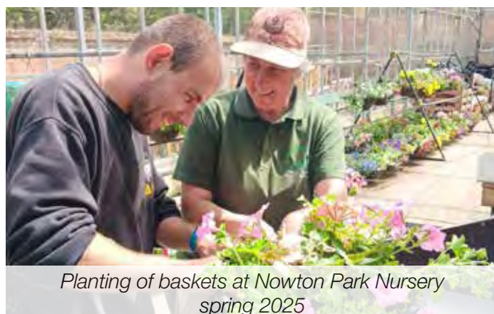
Planting of baskets at Nowton Park Nursery spring 2025