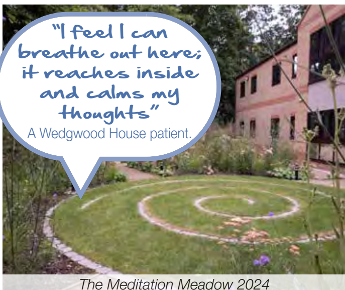
The Meditation Meadow 2024

"I feel I can breathe out here; it reaches inside and calms my thoughts"