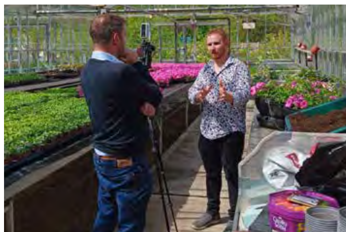
ITV Anglia News filming at Nowton Park May 2025

One of our local schools hosts regular Careers Fairs for their students and invites Bury in Bloom to attend and showcase possible careers within the horticultural industry. West Suffolk College also host regular sustainability networking events, and we find this an invaluable way to not only showcase our work in the community, but it also gives us an opportunity to meet with like-minded eco-conscious individuals to discuss new approaches for the good of the planet.