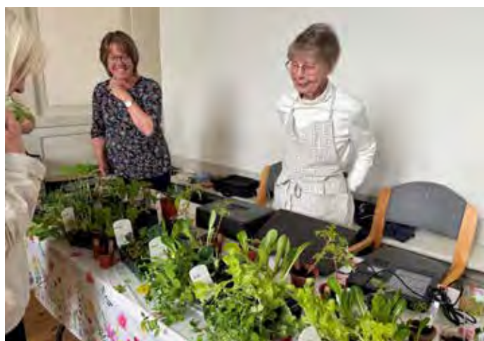
Volunteers behind the Plant Swap table 2025