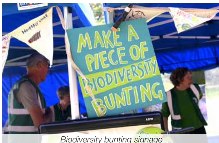
Biodiversity bunting signage