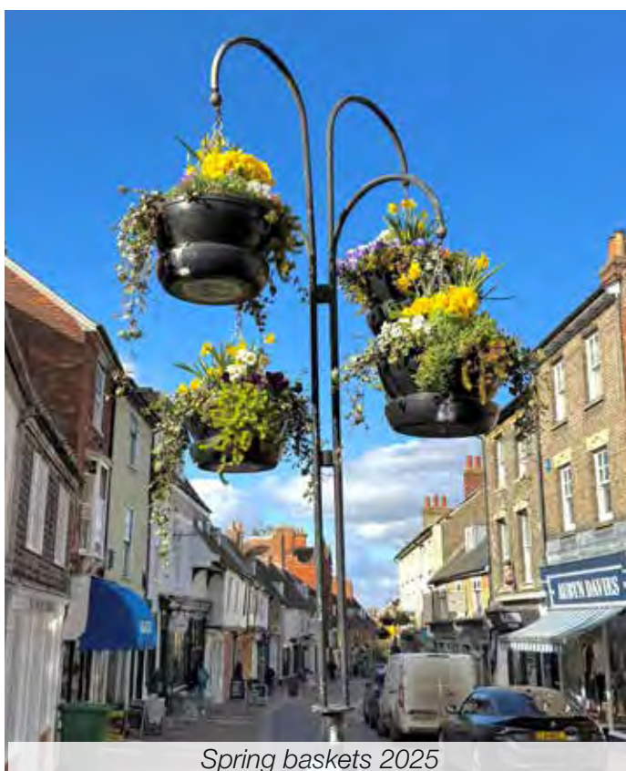
Spring baskets 2025

In winter, we are lucky to receiving funding via BSE Town Council to plant and install hanging baskets and containers full of winter and spring flowering annuals and bulbs such as Pansies, Wallflowers, Tulips and Daffodils – all with nectar rich flowers for early pollinators.