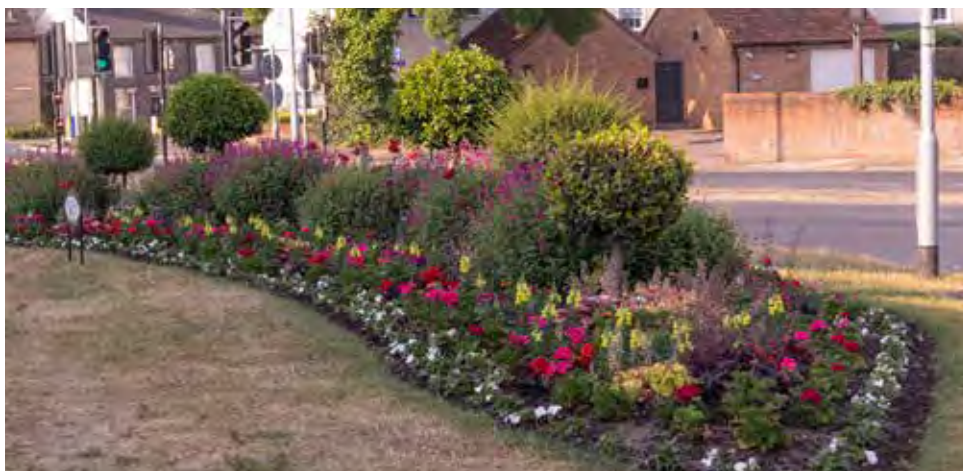
Smile bed Summer 2023