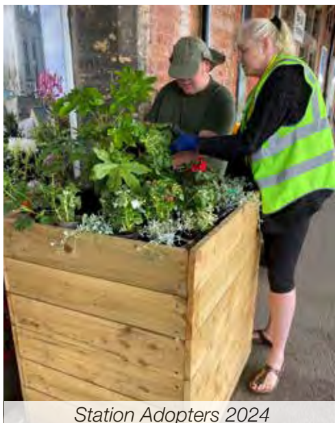
Station Adopters 2024