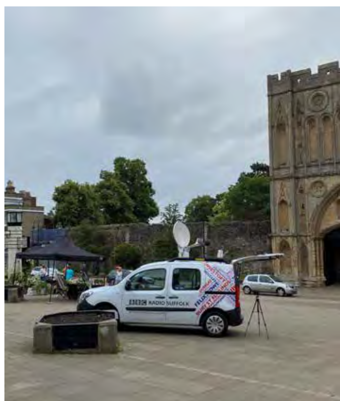
BBC Suffolk coverage 2024