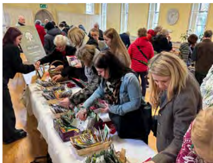
Seed Swap in full swing 2025