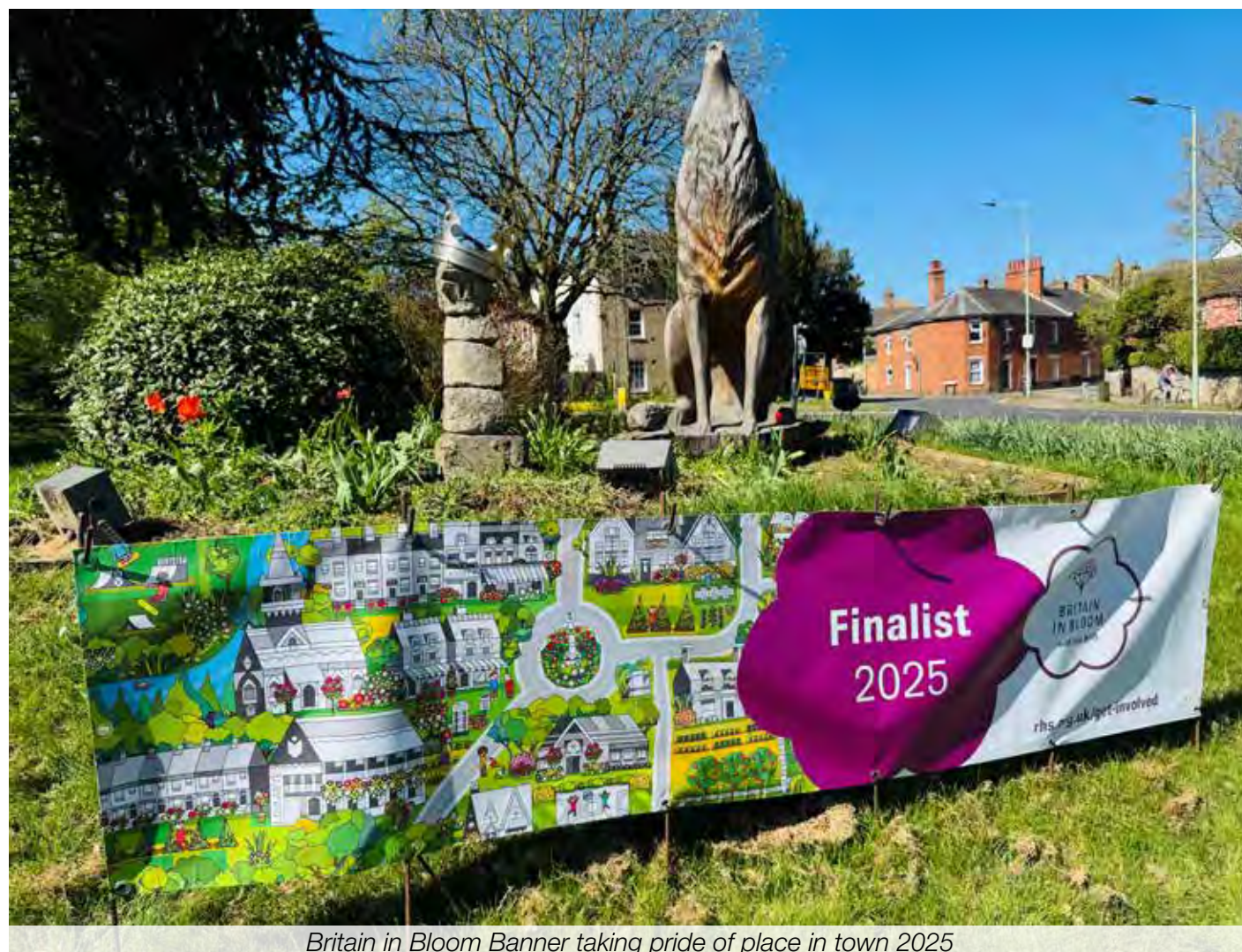
Britain in Bloom Banner taking pride of place in town 2025