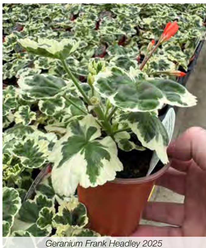
Geranium Frank Headley 2025