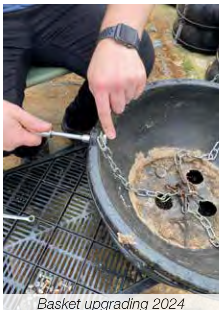
Basket upgrading 2024

We are also lucky to have many active community groups, such as the volunteer Station Adopters at Bury St Edmunds Train Station. Many groups have been entered into It's Your Neighbourhood this year, as we really appreciate all they do to enhance the town.