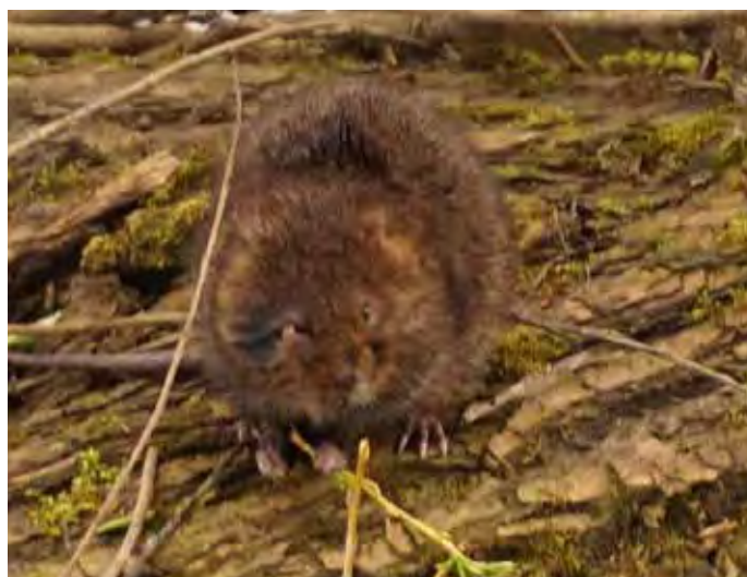
Water Vole spotted in Bury St Edmunds 2024