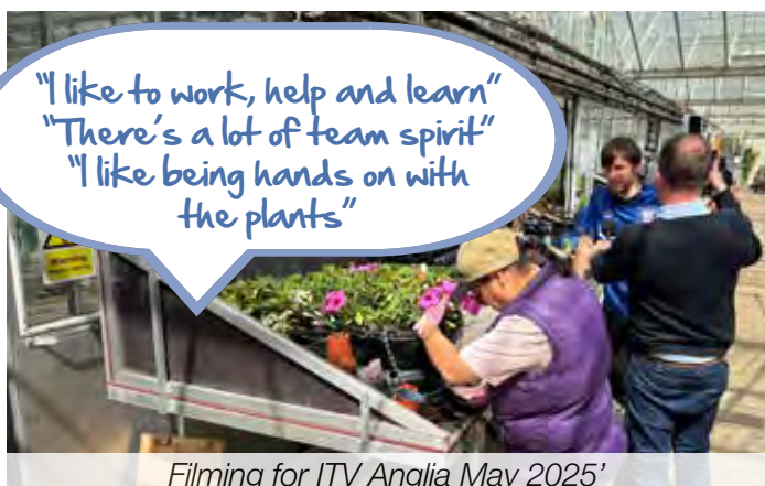
Filming for ITV Anglia May 2025'