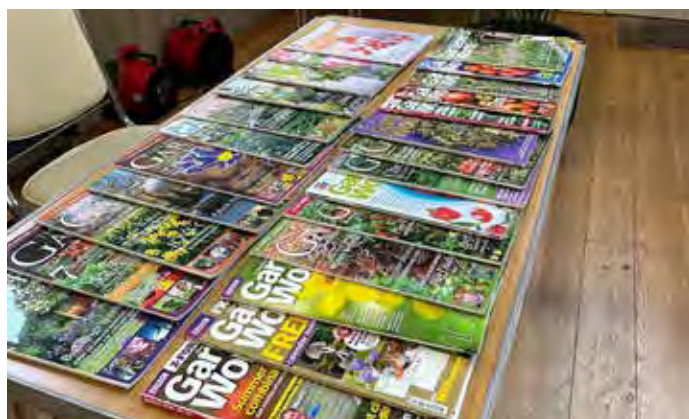
Magazines on offer at the Seed Swap 2025

Who knows what will be next, but you can be sure that the above two will most certainly be returning in 2026!