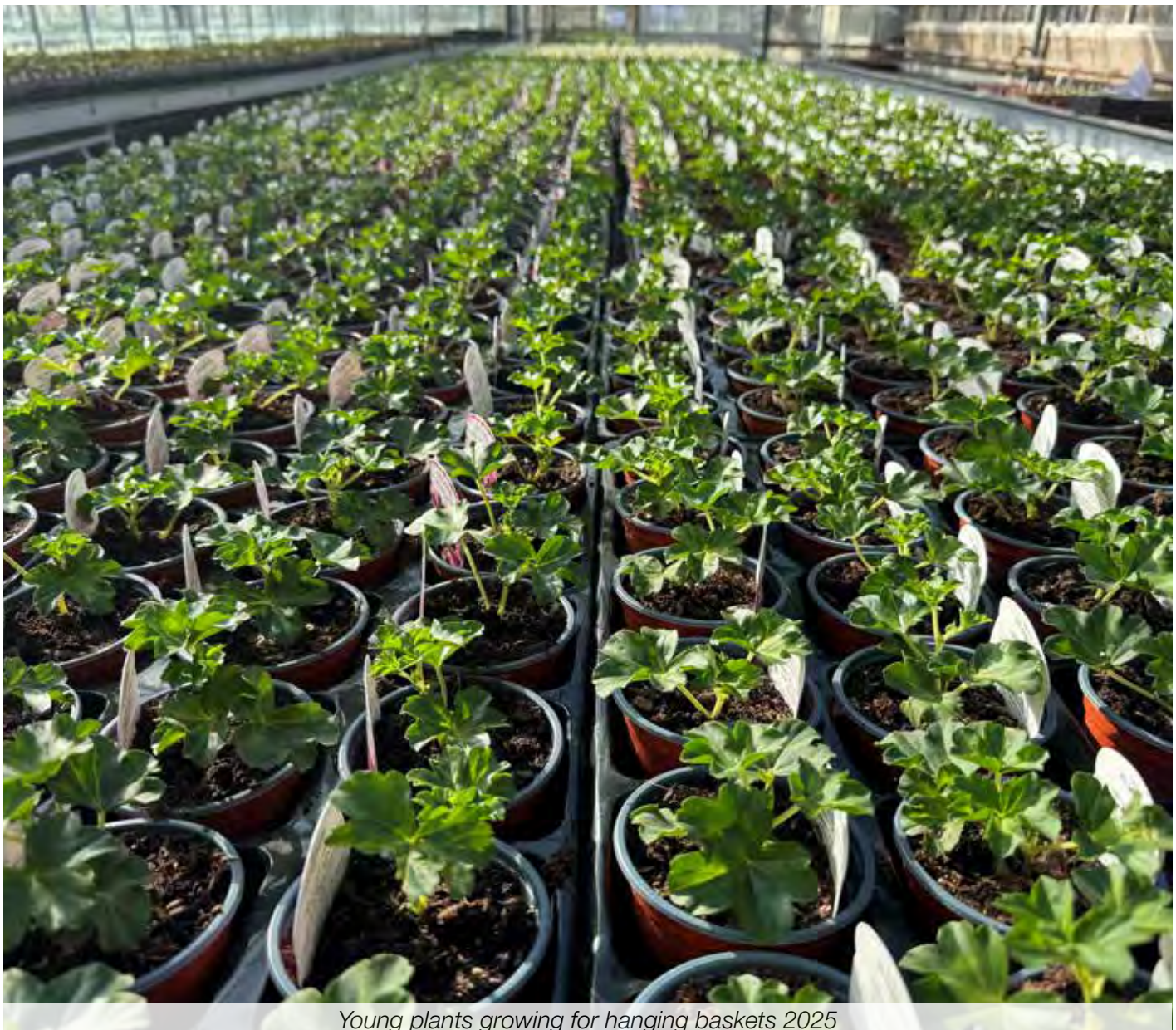
Young plants growing for hanging baskets 2025