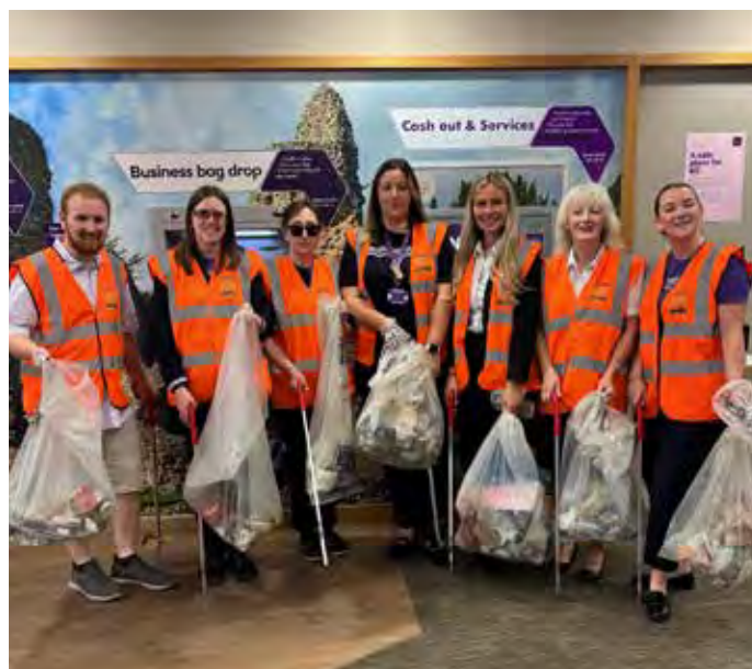
NatWest Community Litter Pick June 2025

It's always lovely to be rewarded for our efforts, and having picked up three Community Awards last year proves that we are certainly getting things right. A win for our Seed Swap, Certificates of Merit and Bury in Bloom in general were all very gratefully received.