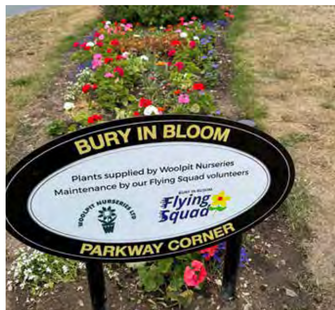
New signage to promote our sponsor and volunteer group June 2025

Weedkiller, although used in small amounts for 'hard to tackle' areas, is now no longer the go-to option for West Suffolk Council. We are very grateful for this at Bury in Bloom.