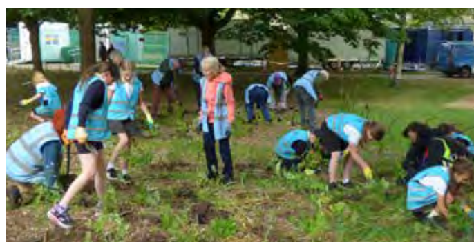
Tollgate School planting in Abbey Gardens May 2025