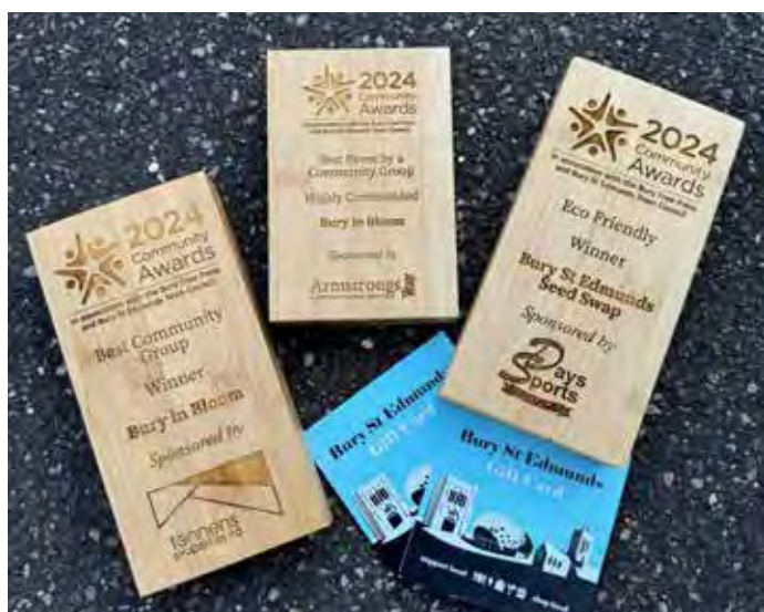
Community Awards 2024

The Hidden Gardens of Bury takes place annually and sees a variety of gardens, often hidden from view, open their gates in a bid to raise funds for St Nicholas Hospice Care.