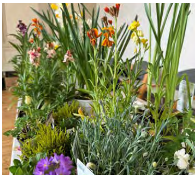
Plant Donations to kickstart the Plant Swap 2025

The Seed Swap returned, bigger than ever, in February this year, and a further BSE Plant Swap then took place at the end of April (Easter weekend) where people could swap their excess seedlings and young plants with one another. The event was sponsored by Havebury and exceeded our expectations – with £120 raised for Bury in Bloom.