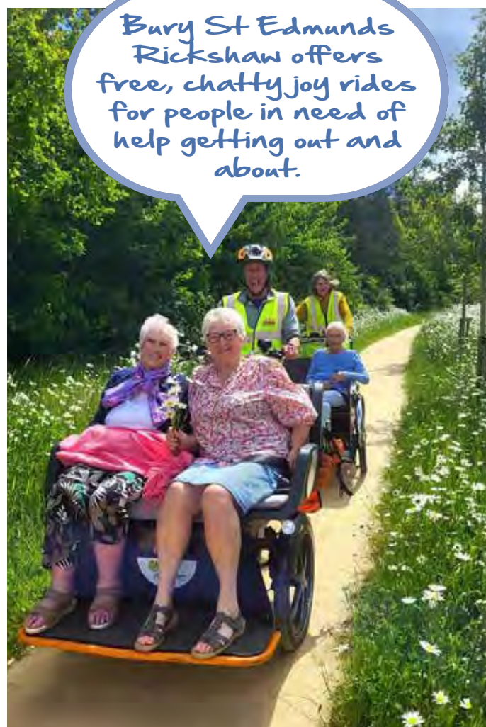
Rickshaw joy ride in Bury St Edmunds 2025

Our Bury St Edmunds, the town's BID, has a policy of removing graffiti as soon as it's reported and the Council ensures streets are swept regularly and bins emptied before they become an issue. Litter picks are regularly performed, often unnoticed, by dedicated residents and bodies who take pride in their local area. Signage is also regularly maintained and updated.