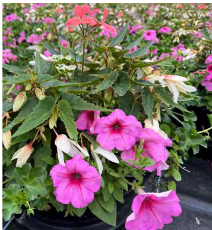
Baskets plants 2025

With sustainability in mind, none of our plants are imported. We only source locally and from approved