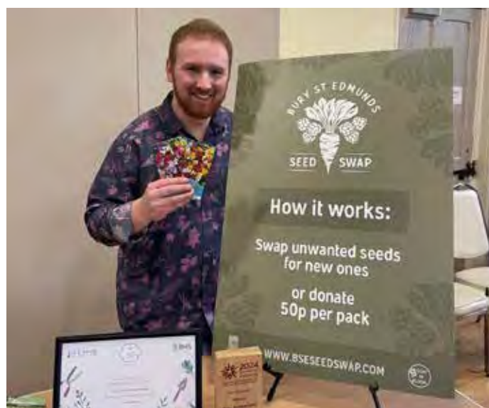
How it works signage and awards at the Seed Swap 2025