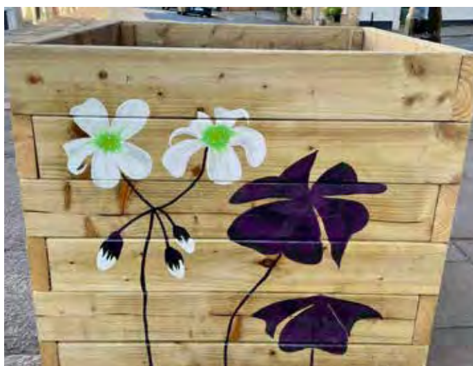
A herb planter Oxalis mural 2025