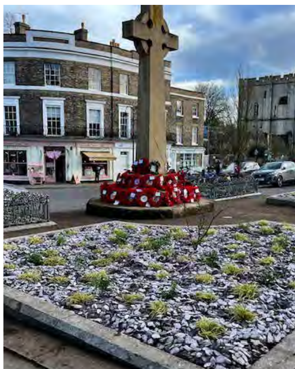
War Memorial planting Feb 2025