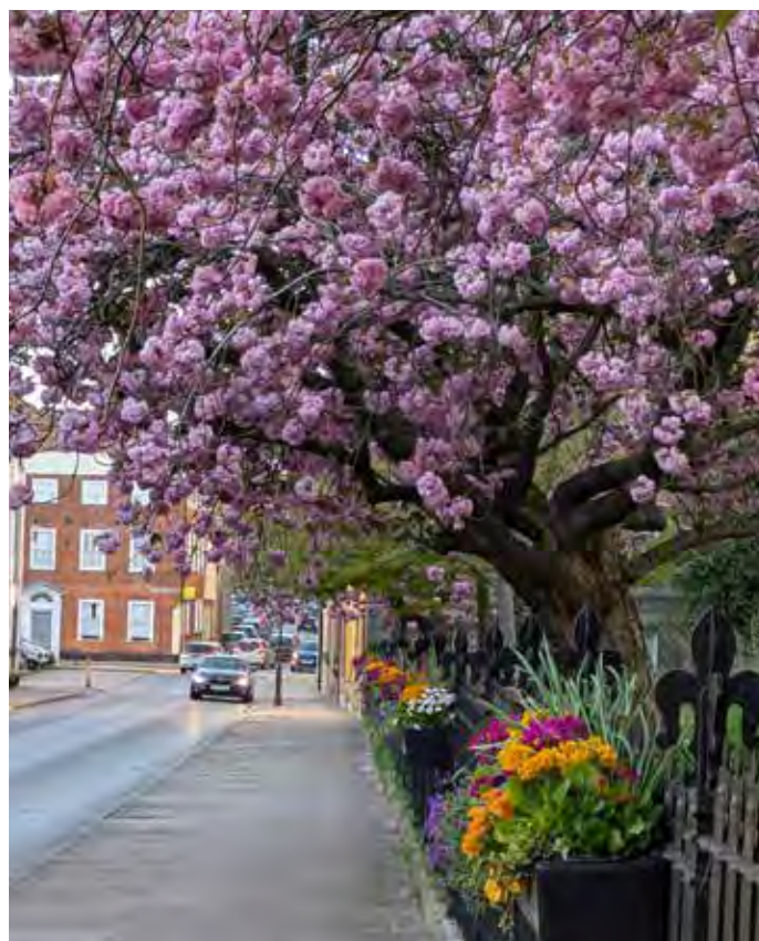
Spring colour 2025

Structure is also very important, hence why you can often find a mix of shrubs, perennials and trees within our displays. We know the importance of impactful displays in key roadside locations for visitors and residents alike, so planning of each scheme is crucial.