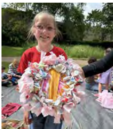
A fabric flower made at the workshop May 2025