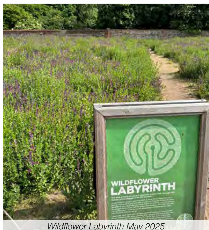
Wildflower Labyrinth May 2025