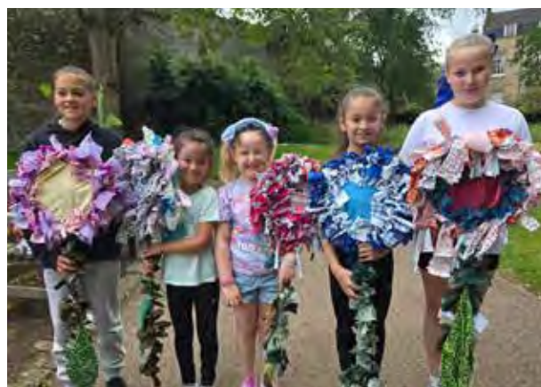
Flower creations at the Abbey Gardens workshop May 2025