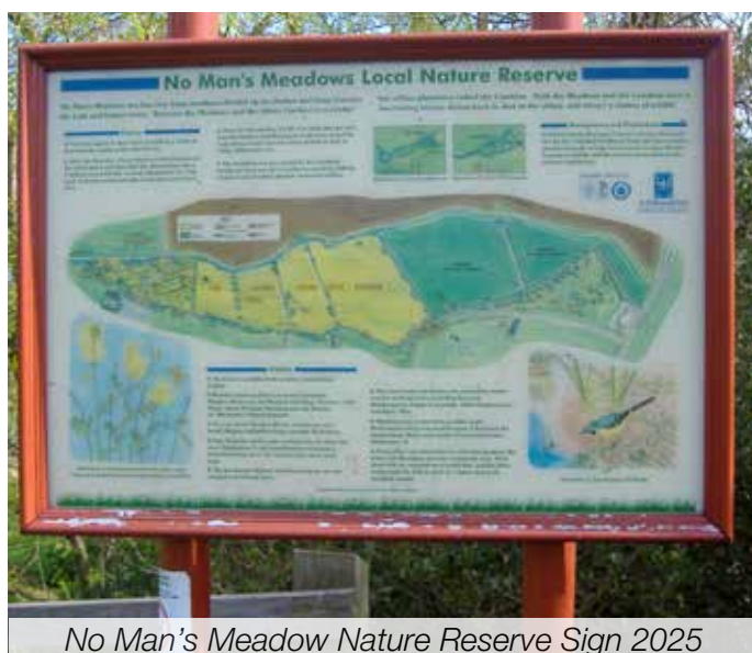
No Man's Meadow Nature Reserve Sign 2025