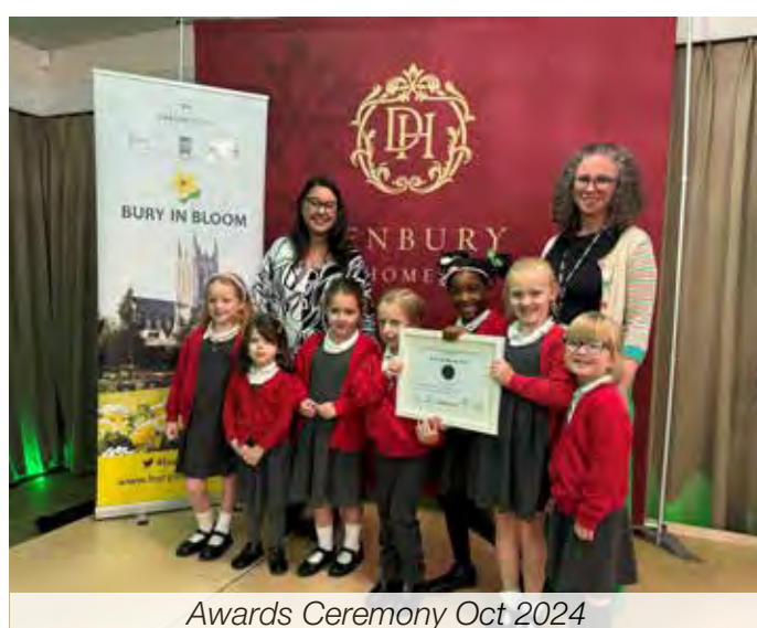
Awards Ceremony Oct 2024