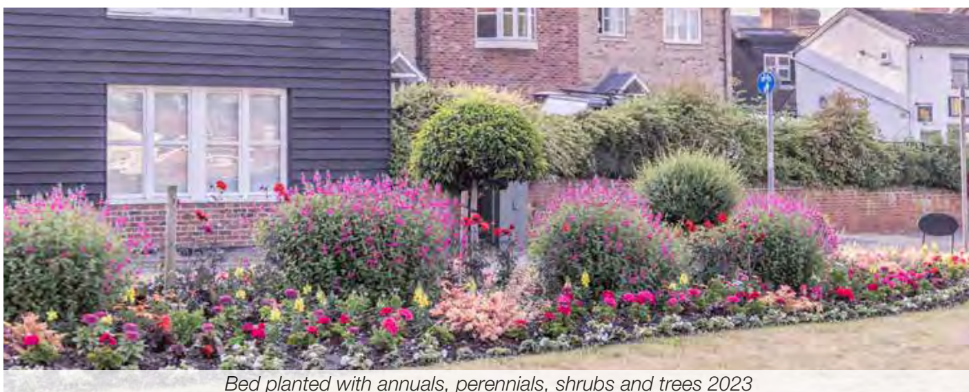
Bed planted with annuals, perennials, shrubs and trees 2023

Last year, we begun swapping annual bedding displays for pollinator-friendly perennials. This, in collaboration with West Suffolk Council, was to not only reduce costs but to encourage beneficial insects to thrive and to save on plant wastage and watering. With more plans in the pipeline, such as continuing our trial of perennials in baskets, Bury St Edmunds is leading the way in encouraging biodiversity and a sustainable future for all.