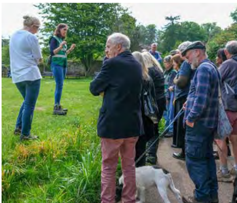
A guided walk at the Wildlife Day 2024