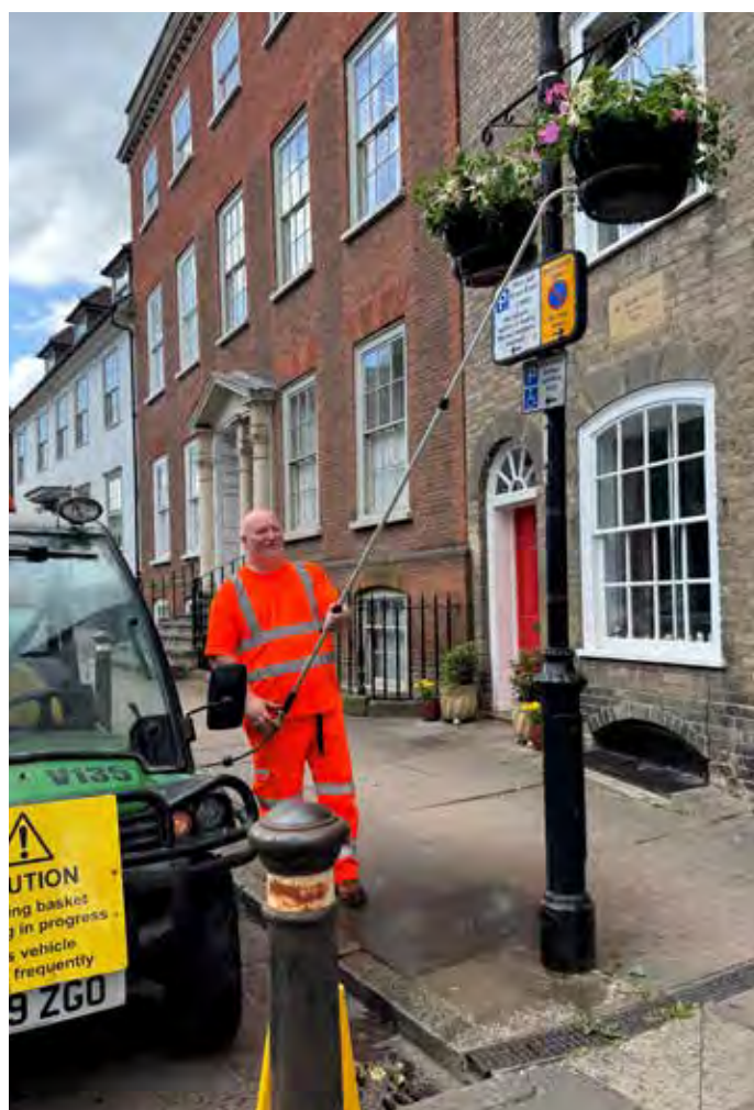
Hanging Baskets being watered with harvested rainwater 2025