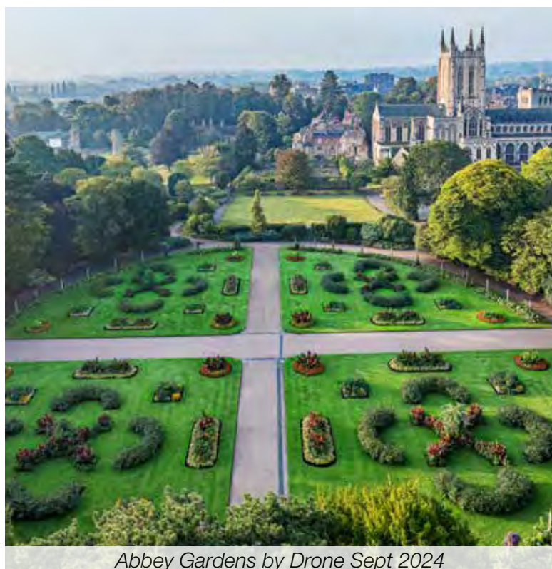
Abbey Gardens by Drone Sept 2024