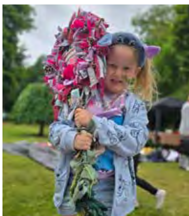
A fabric flower at the workshop May 2025