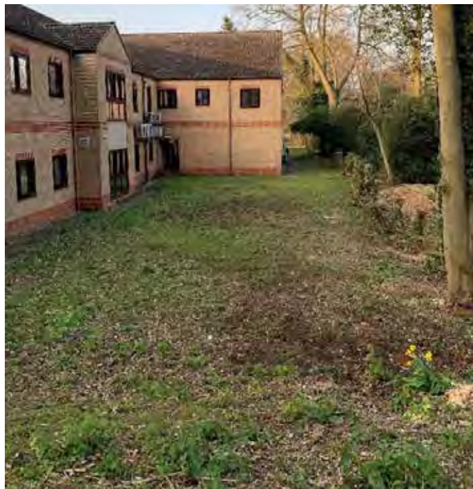
Before transformation June 2023

The Trusts' mission was to offer a place of recovery and reflection, as well as a hub for therapeutic horticultural activities; a safe and welcoming garden where user groups can learn about sustainability in all its forms, from gardening for beginners, growing food, nutrition and healthy living to gardening for wildlife, biodiversity and the environment. Creative workshops including art, crafts and seasonal sessions are also included. Volunteers turn out weekly to help maintain the garden, which consists mostly of nectar-rich perennials, shrubs and small trees, as well as sculpture and a grass meditation area.