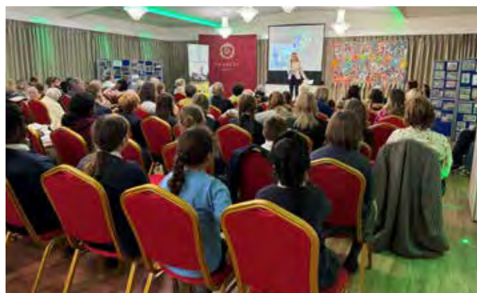
Awards Ceremony Oct 2024