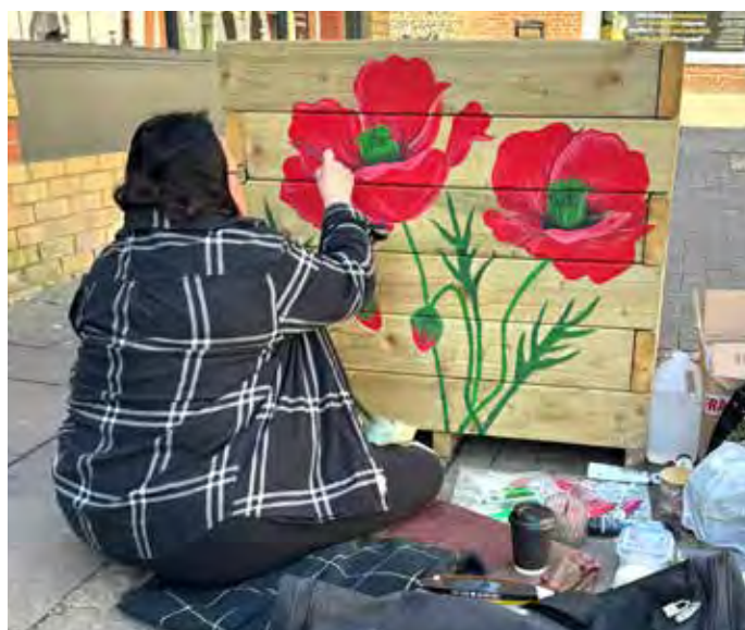
A herb planter Poppy mural 2025

Each planter offers a different flavour, to suit various different meals and drinks. They are also planted at a height to offer those with mobility issues the chance to pick their own herbs, and Realise Futures, our hanging basket supplier, have committed to maintaining these throughout the year.