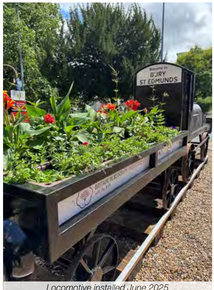
Locomotive installed June 2025