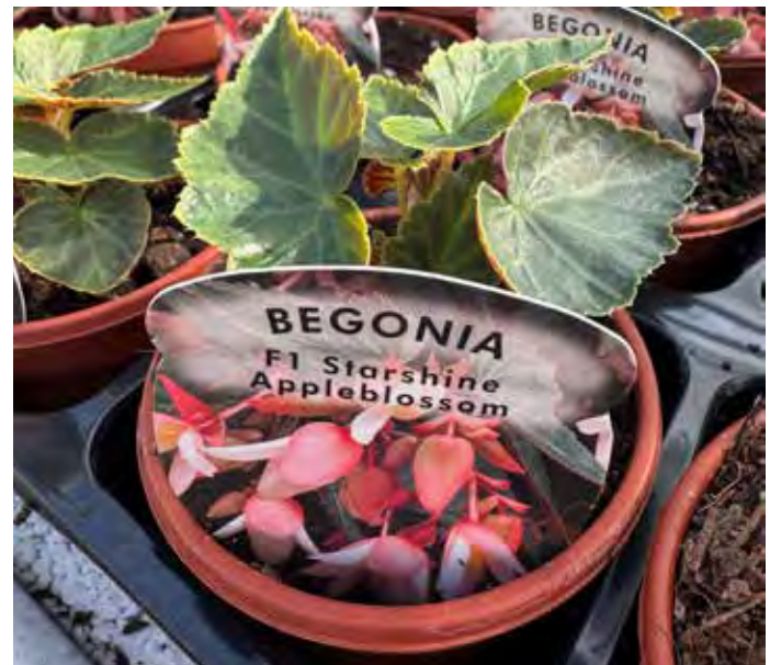
Begonia Starshine 'Appleblossom' in a 9cm pot

When preparing new sites, soil is always professionally tested before any planting commences, so that we know how best to improve the soil and control the quality of the plants to follow.