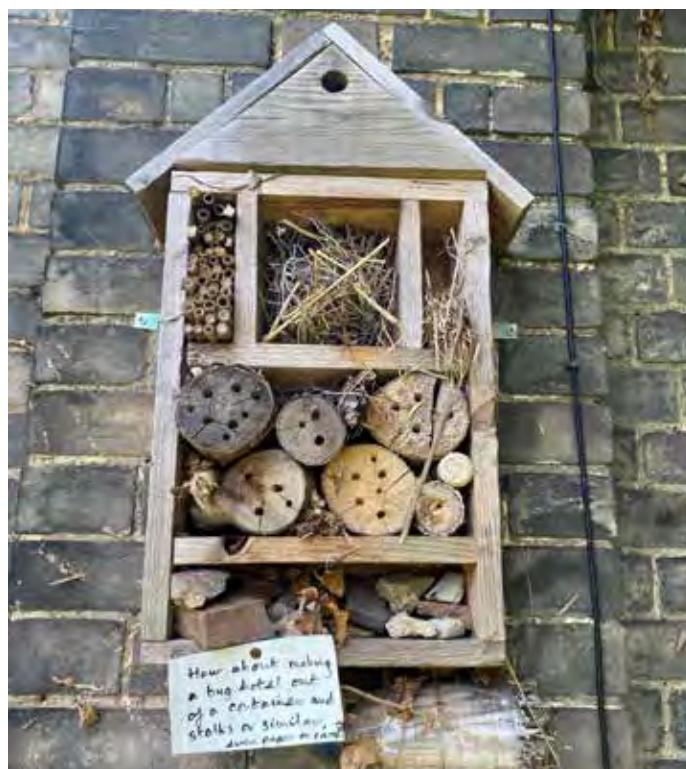
A bug hotel at the Quaker Meeting House 2024

These are just a few of the steps we've already made towards creating a cleaner and greener Bury St Edmunds, with many more to follow over the coming years.