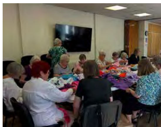
Oddfellows workshop May 2025