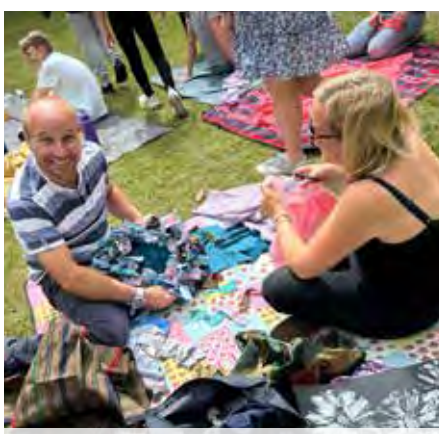
A family friendly workshop May 2025