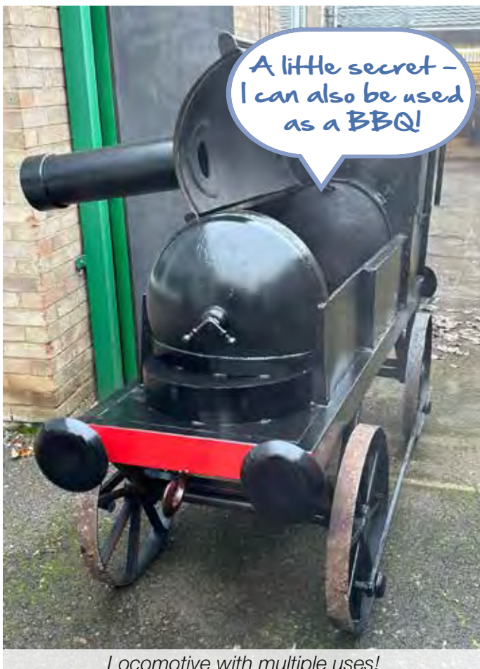
Locomotive with multiple uses!