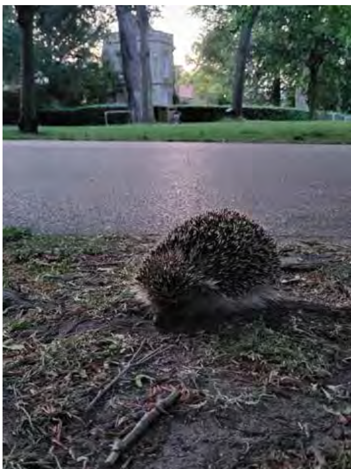
Hedgehog spotted in Abbey Gardens 2025