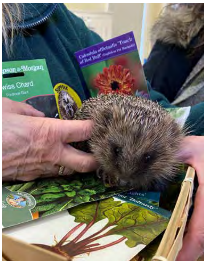
A Hedgehog in rehab at the Seed Swap 2024

When we first started our annual Seed Swap, the very first charity we decided to raise funds for was Suffolk Hedgehog Hospital – for which £179 was raised in donations. Moreton Hall Residents Association have also been active in raising money for signage to make drivers aware of hedgehogs on the highway, with events being held to educate people on the important of encouraging them into your own gardens.