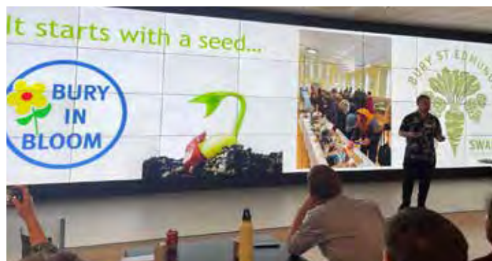
Networking event presentation 2024

Every so often, one or two local schools are invited to help plant vast numbers of bulbs and other plants within the Abbey Gardens. This year, Tollgate School students spent half a day planting Rubus Cockburnianus amongst the spring bulbs that they planted in November 2024. The excitement from the children enjoying themselves was infectious and truly inspiring.