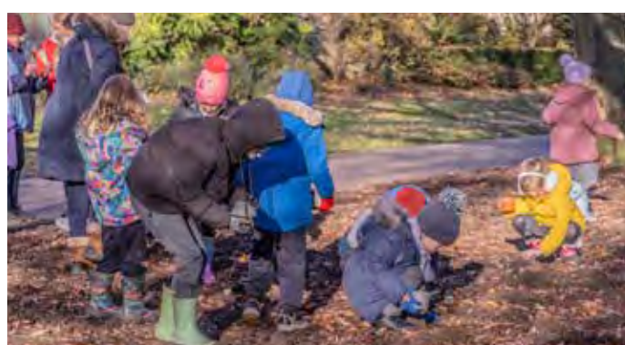
Tollgate School planting bulbs in Abbey Gardens Nov 2024