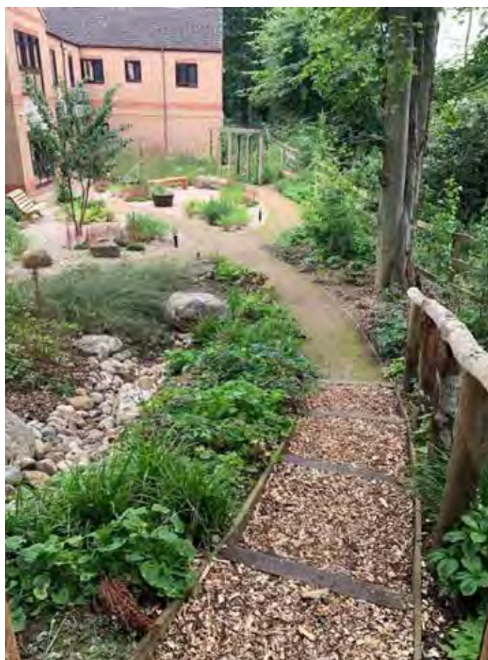
After transformation July 2024